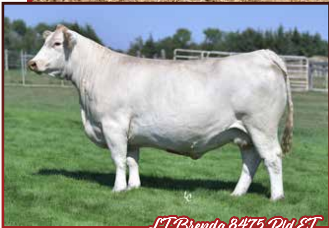
LT Brenda 8475 PLD ET

EPDs rank top 3% Milk, 4% BW, 5% CE, 8% Mtnl, 10% TSI, 20% CW, REA, Marb.